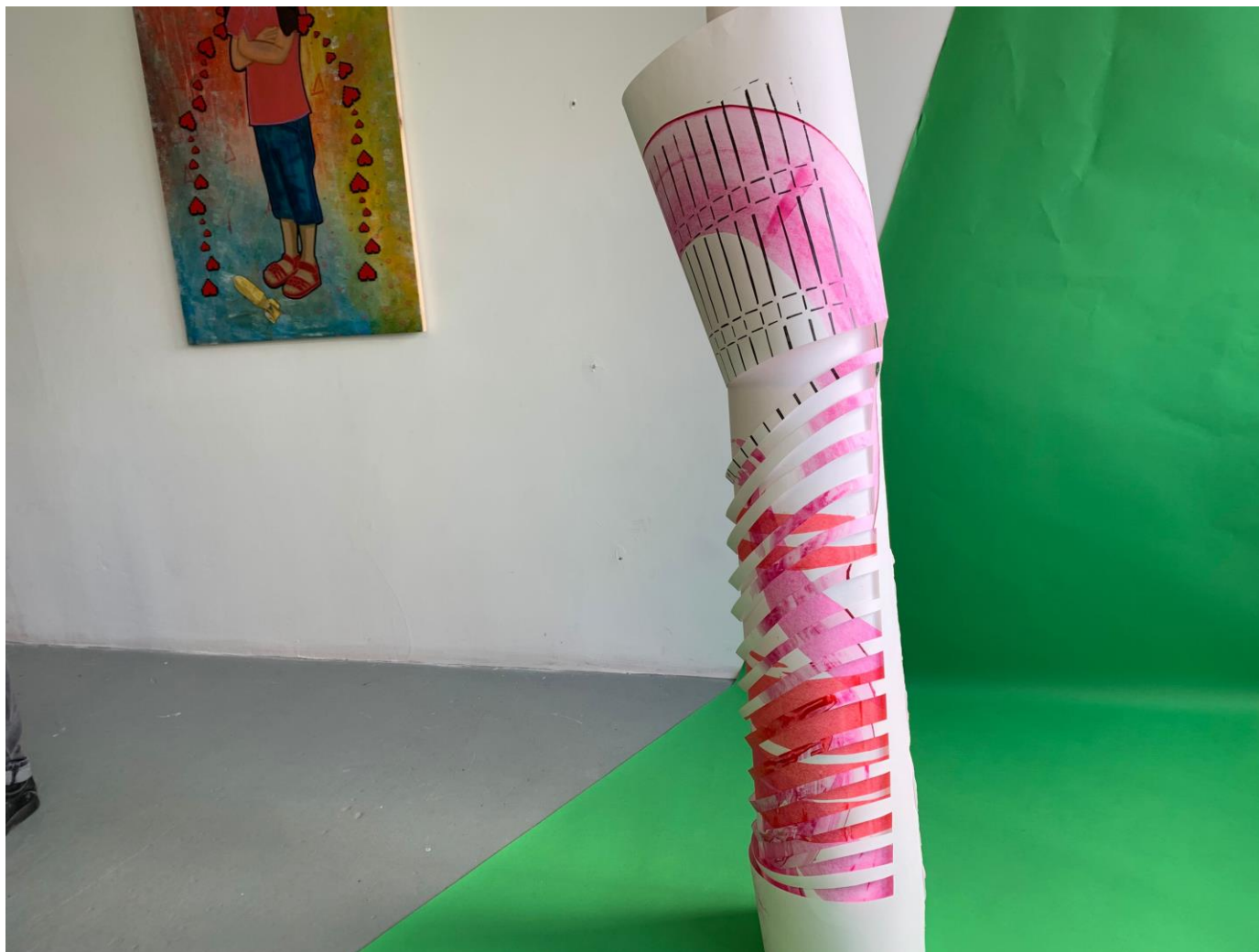
Untitled (2022) Stryx