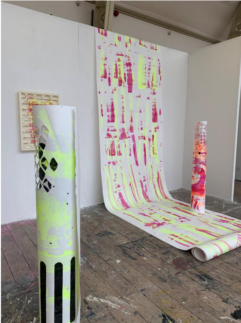
Construction (series) (2022) Degree show