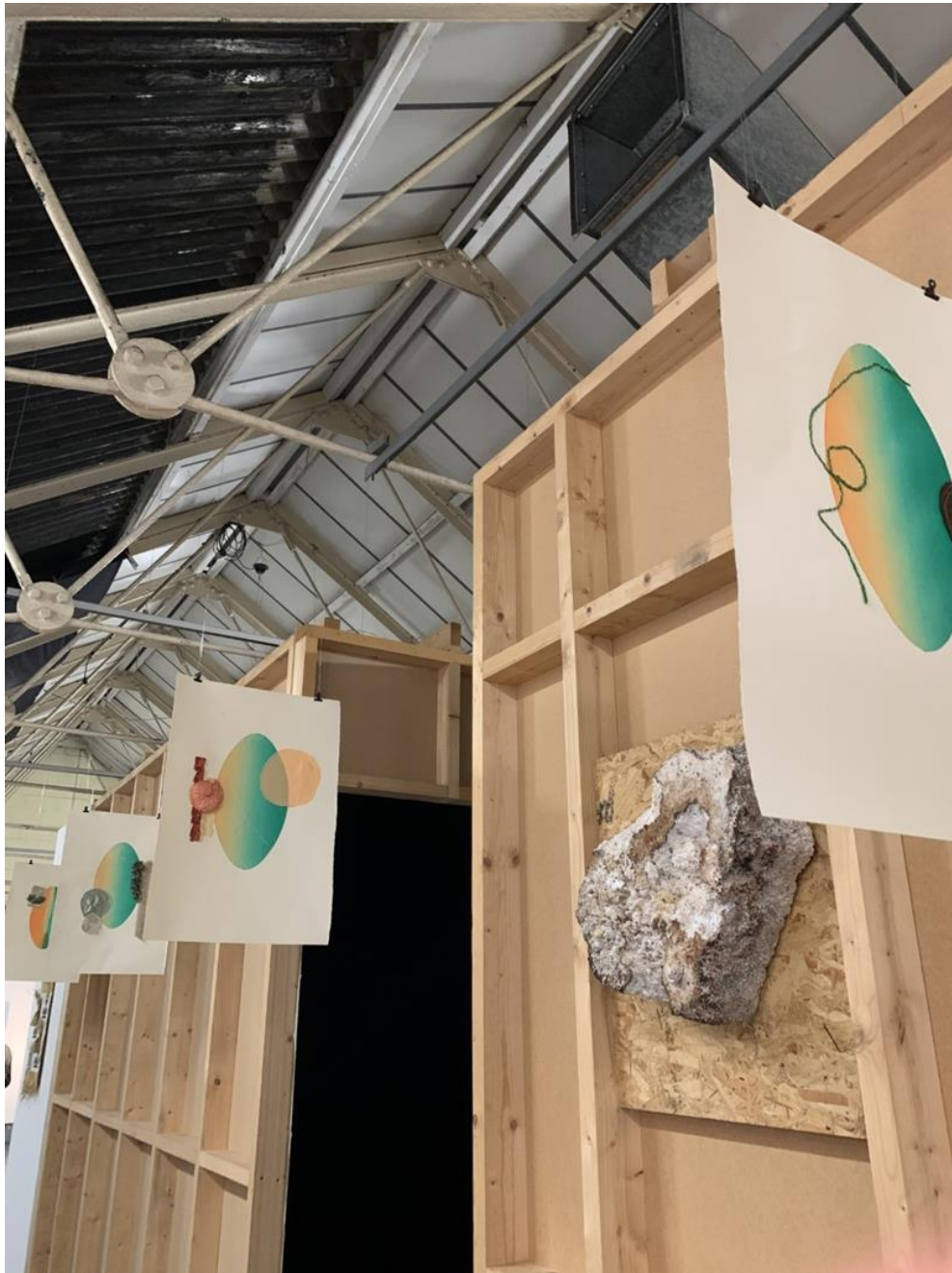
Untitled (2022) Vivid Projects

Paper, ink, various fabric, synthetic wool, wood beads, cotton thread, clear wire, clips. 4x [42cm x 29.7cm]