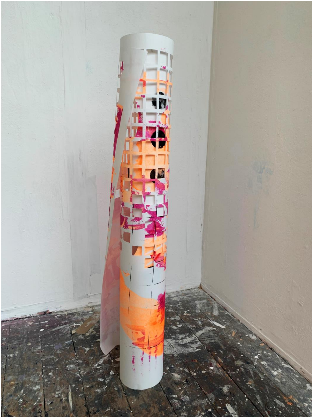
Layer #3 (2022) Degree show