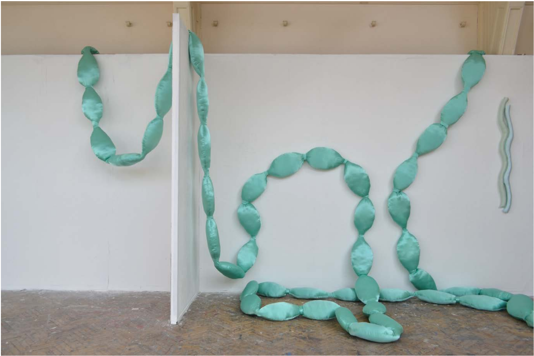
Inter-link , 2022, silk and polyester batting.