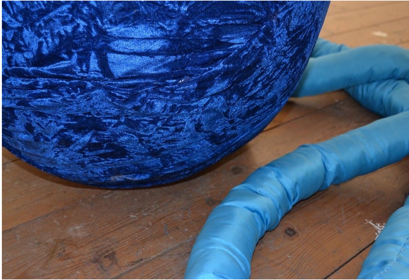
Untitled , 2021, silk and velvet, synthetic polyester filling.