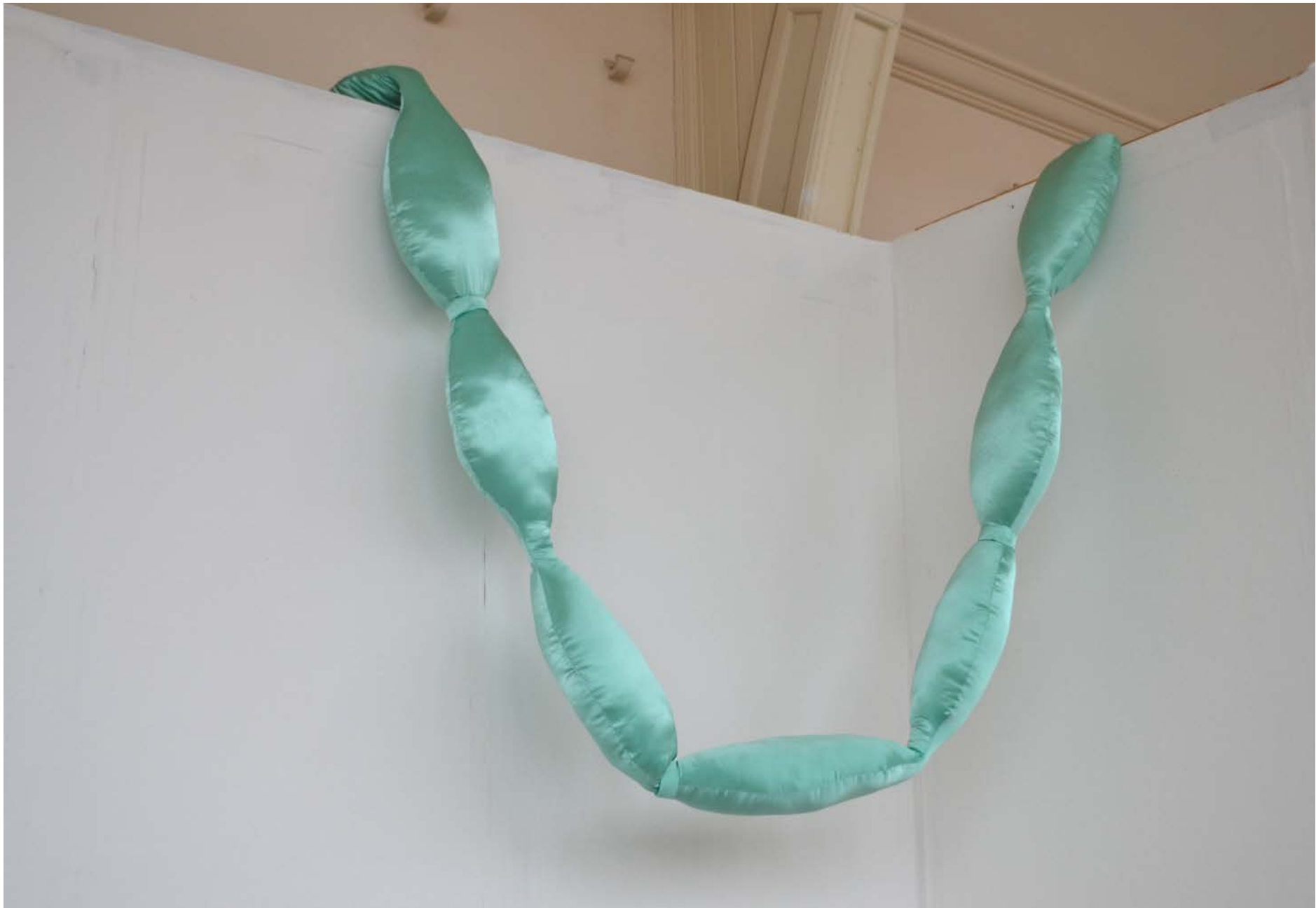
Inter-link , 2022, silk and polyester batting.