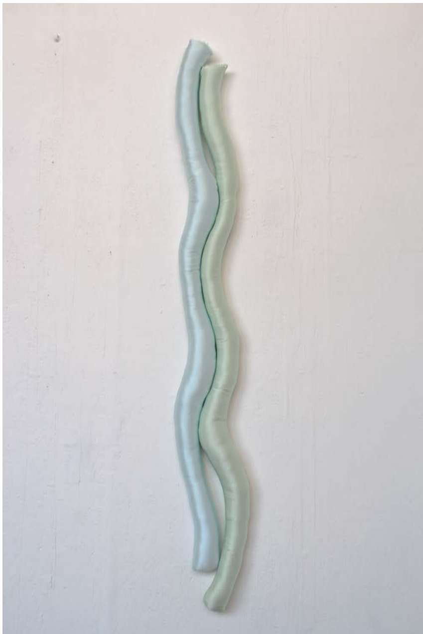
Miscellaneous, 2022, silk and polyester batting.