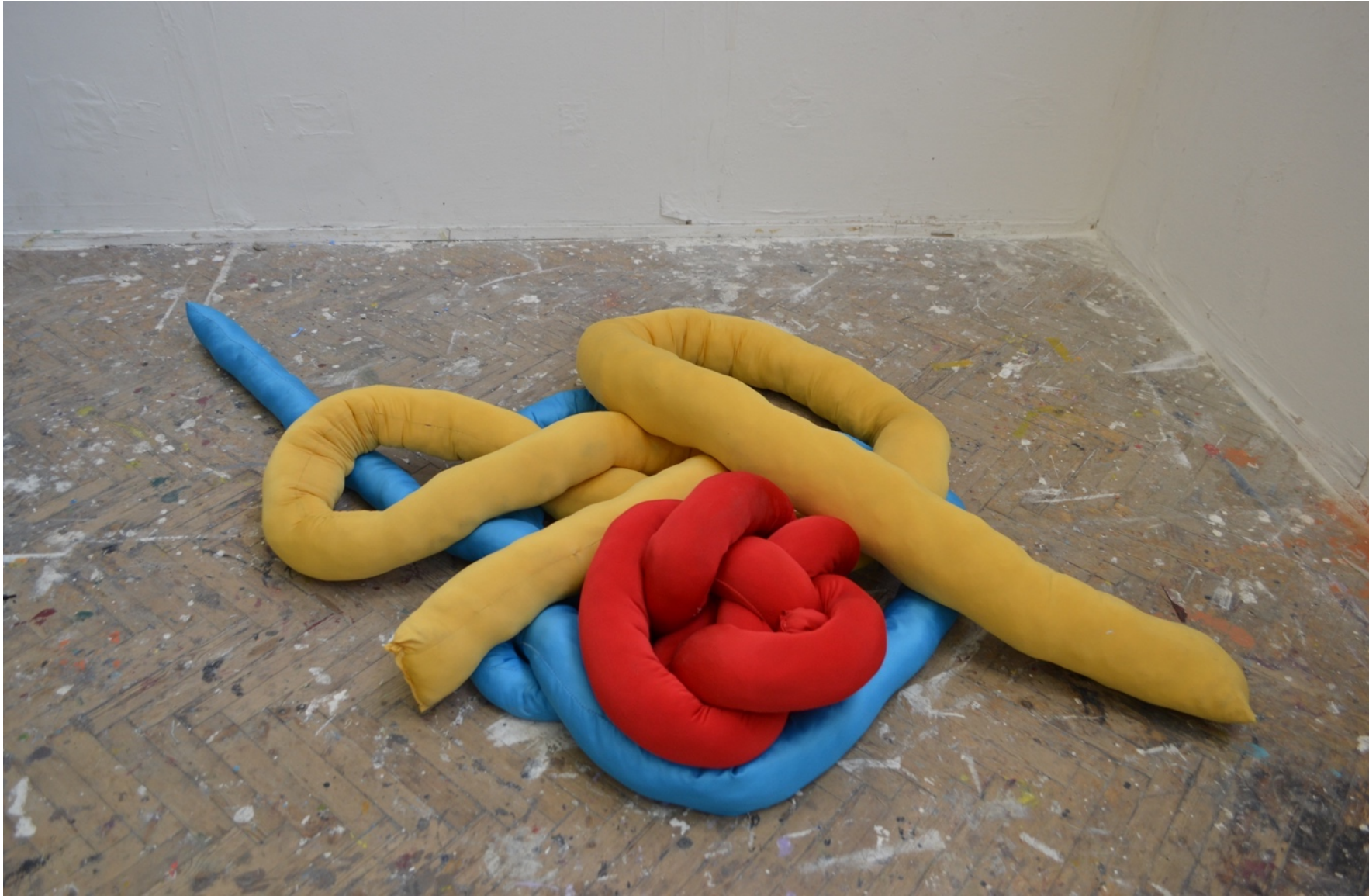
Sensory Noodles , 2021, silk and lycra, synthetic polyester filling.