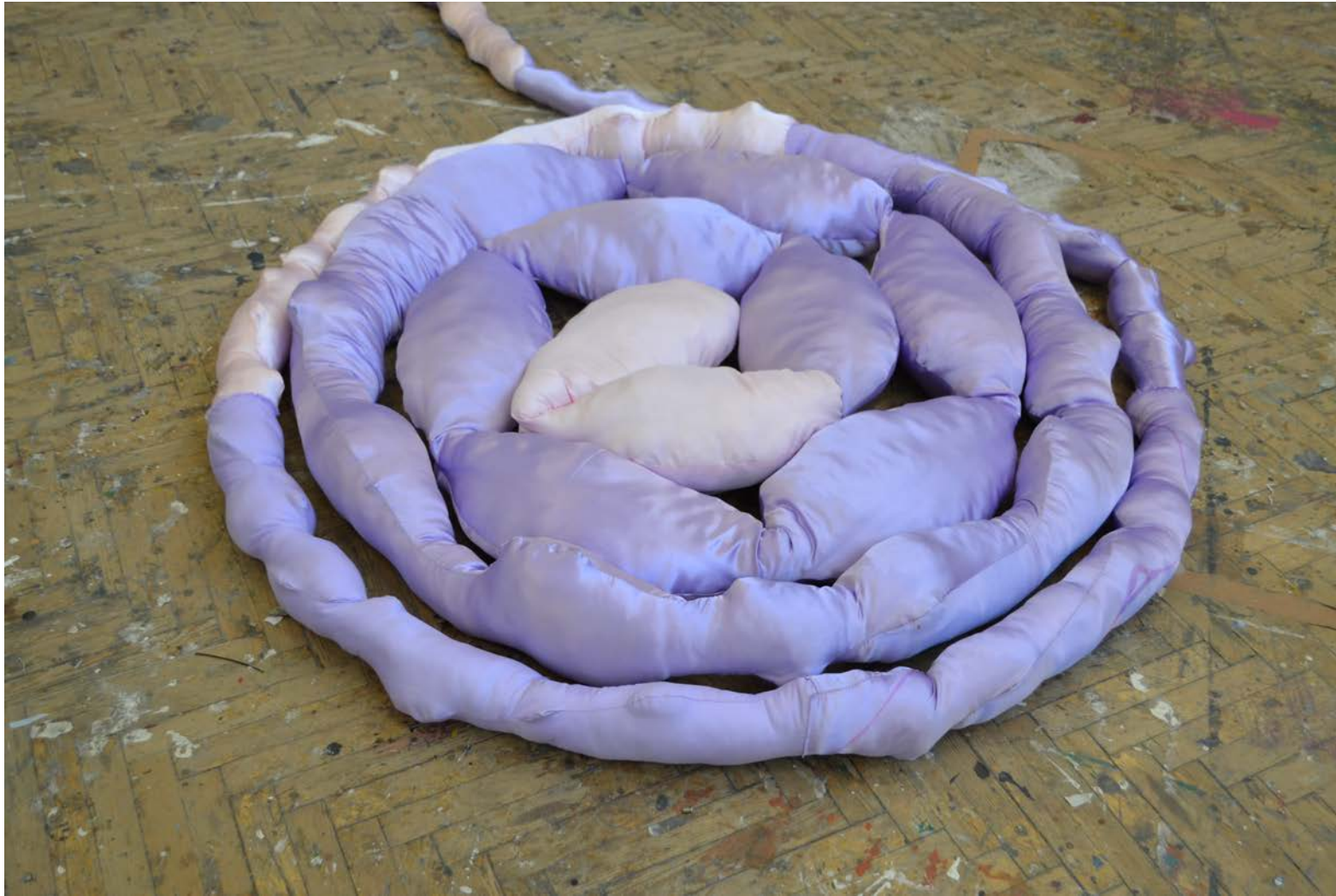
In the space: out the space , 2022, silk and synthetic polyester filling.