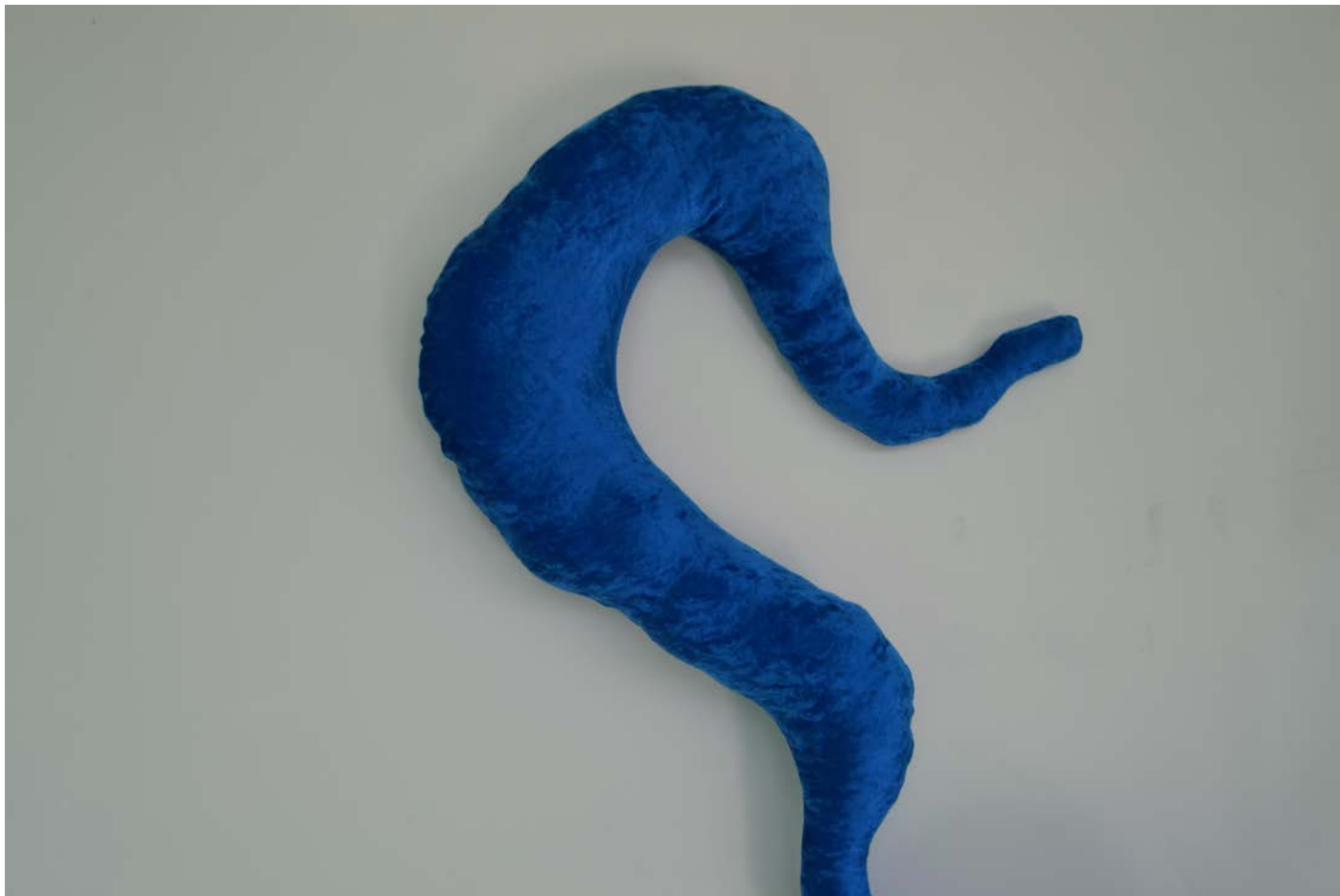
misshapen , 2022, velvet and synthetic polyester filling.