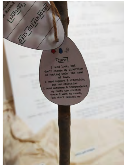
There is No Wrong Way 2021

UNIDENTIFIED SEED I don't of root I need su but n I need auton my roots where I wa but don't ne Features I am growing and I am learning and I will keep exploring