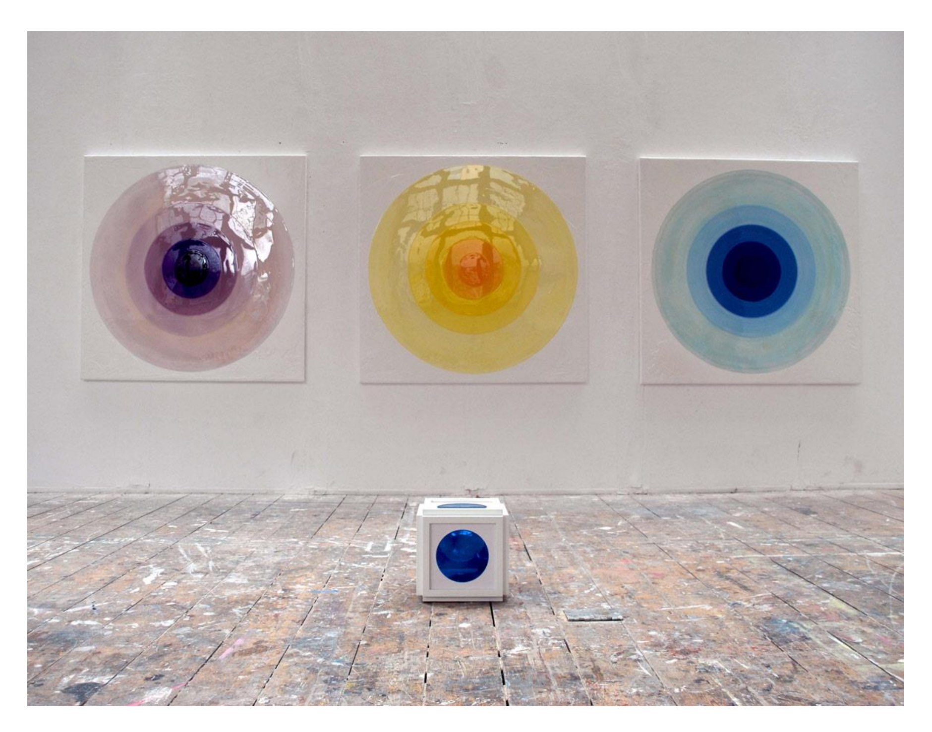
Nuances: Levels of Intensity, 2021 (resin and Acrylic on linen canvas board)