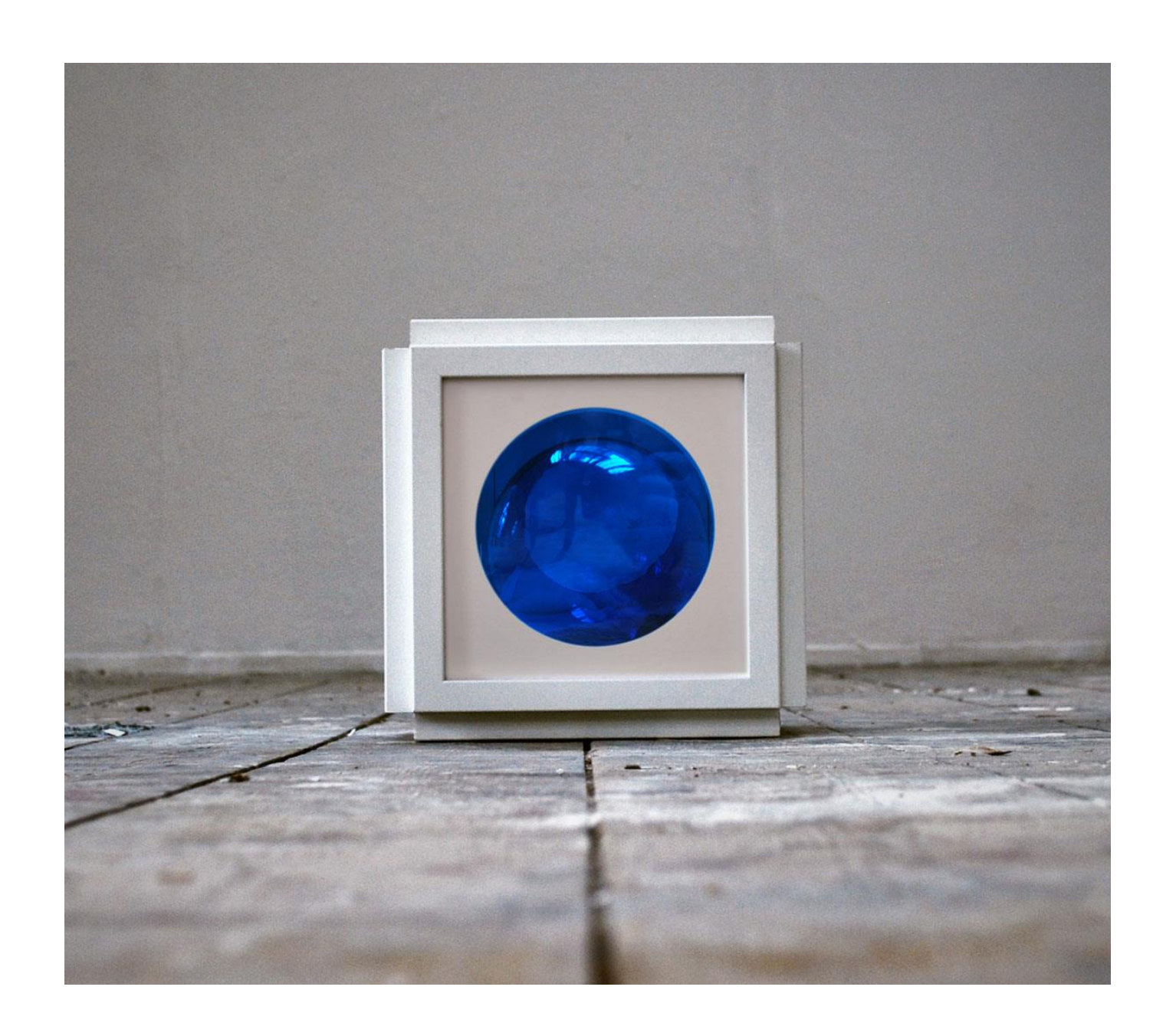
Cubic Blue, 2021 (assemblage wood and glass)