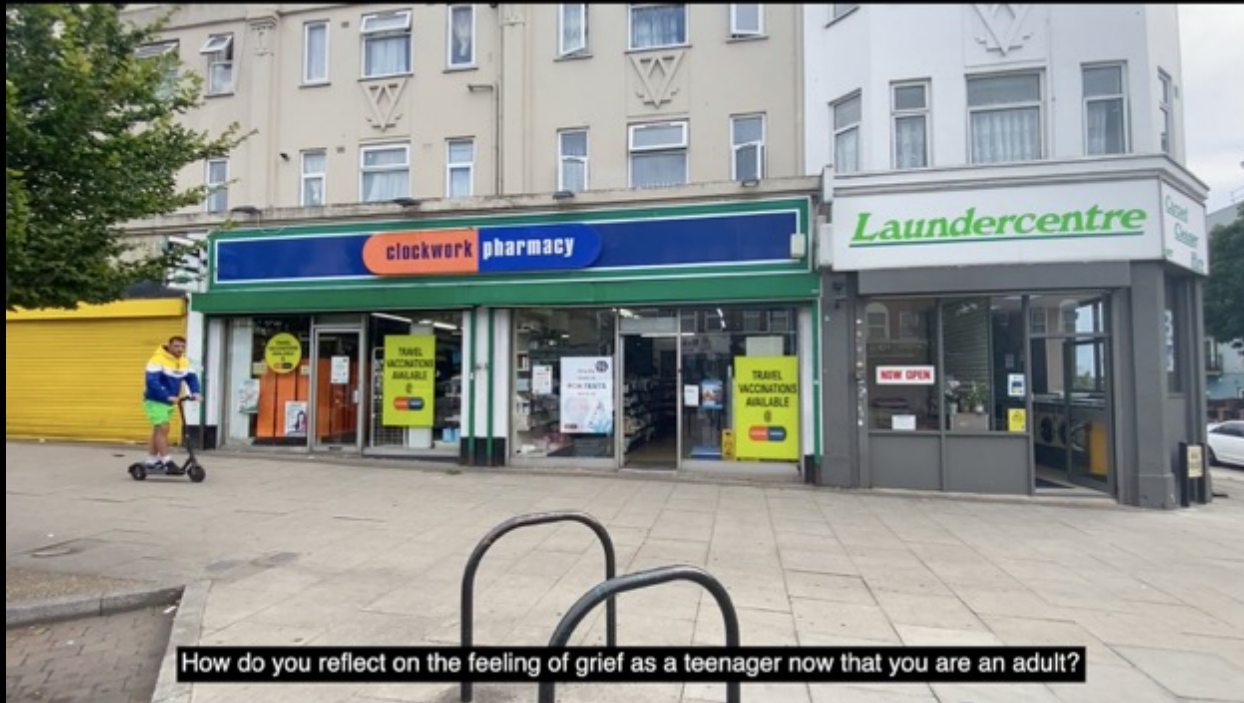
How do you reflect on the feeling of grief as a teenager now that you are an adult?