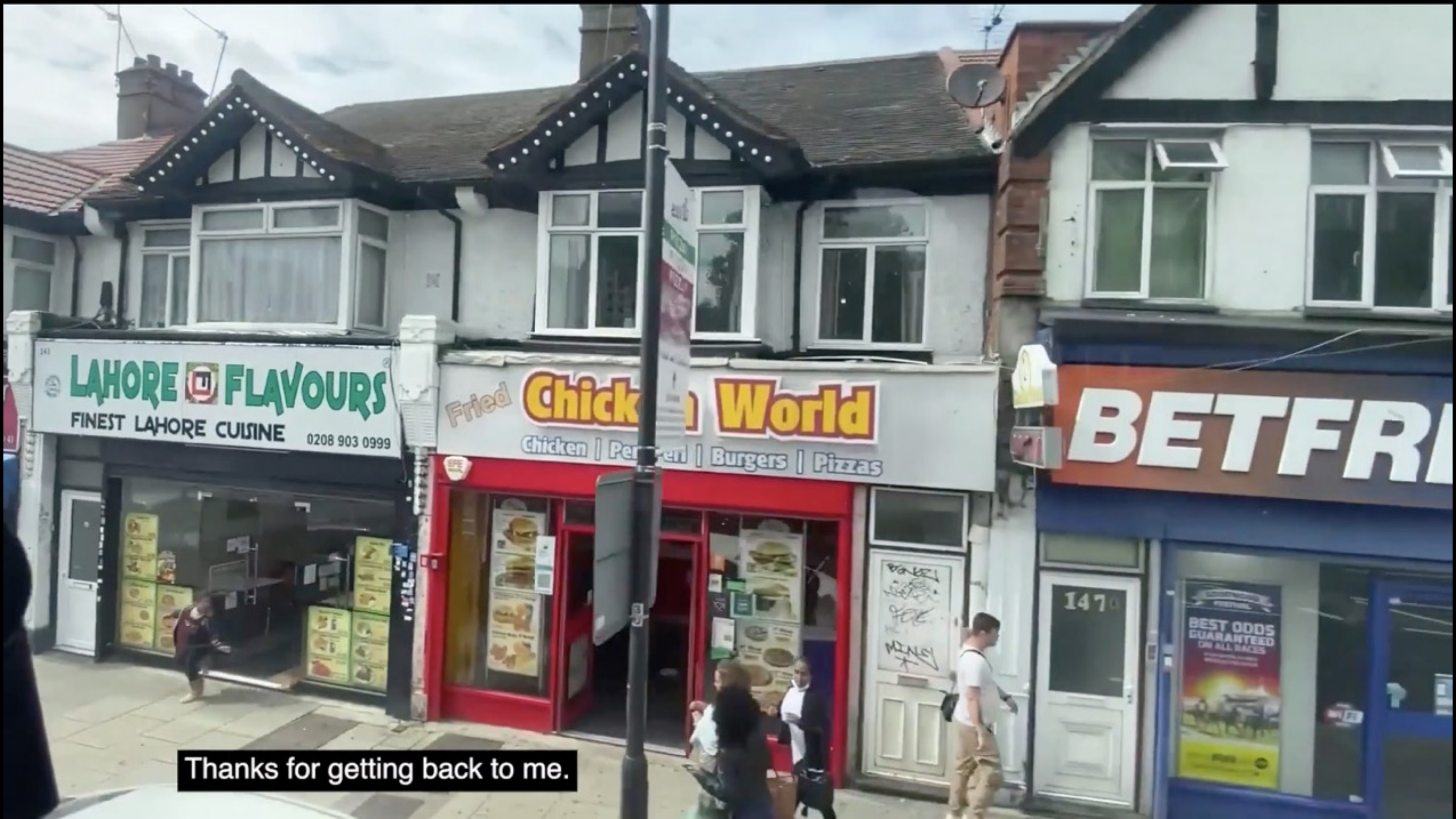
Thanks for getting back to me.