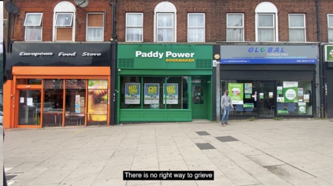
There is no right way to grieve