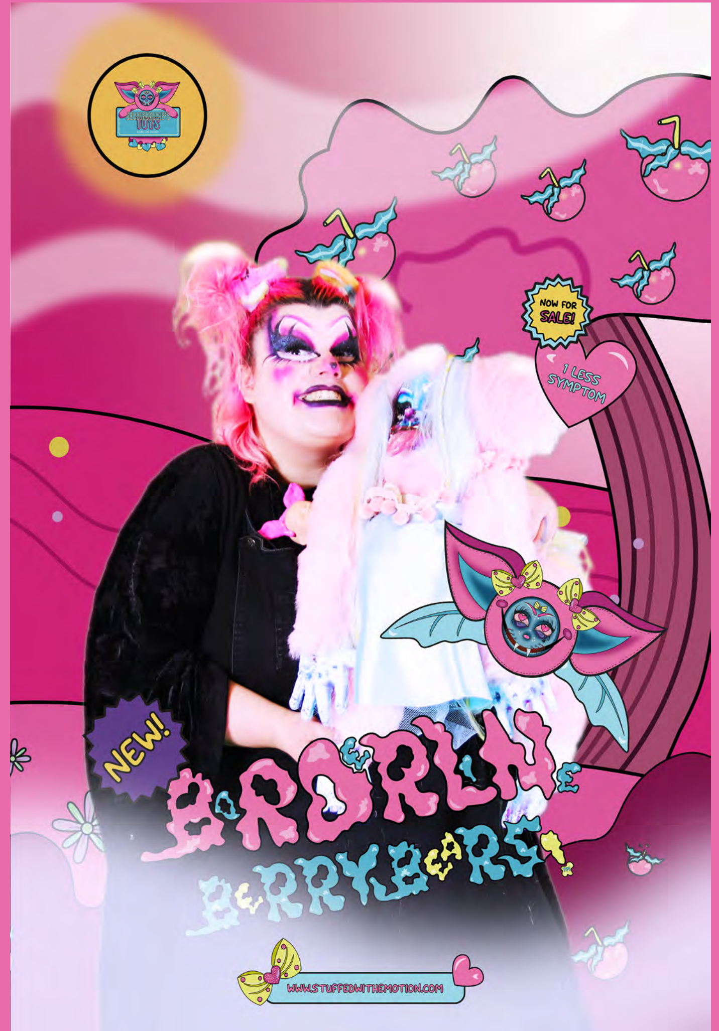
The princess is happy now, maybe to happy? (2021), Jessica Overdijk dm. 1189 x 841 mm