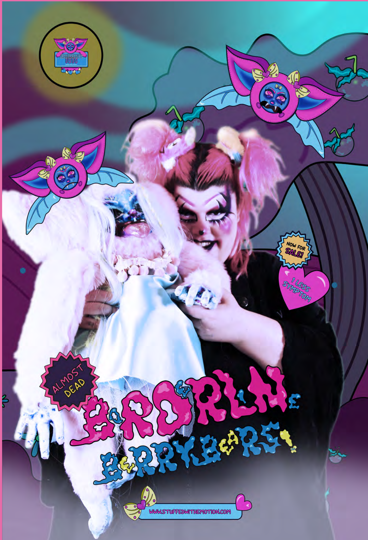
The princess has anxiety (2021), Jessica Overdijk dm. 1189 x 841 mm