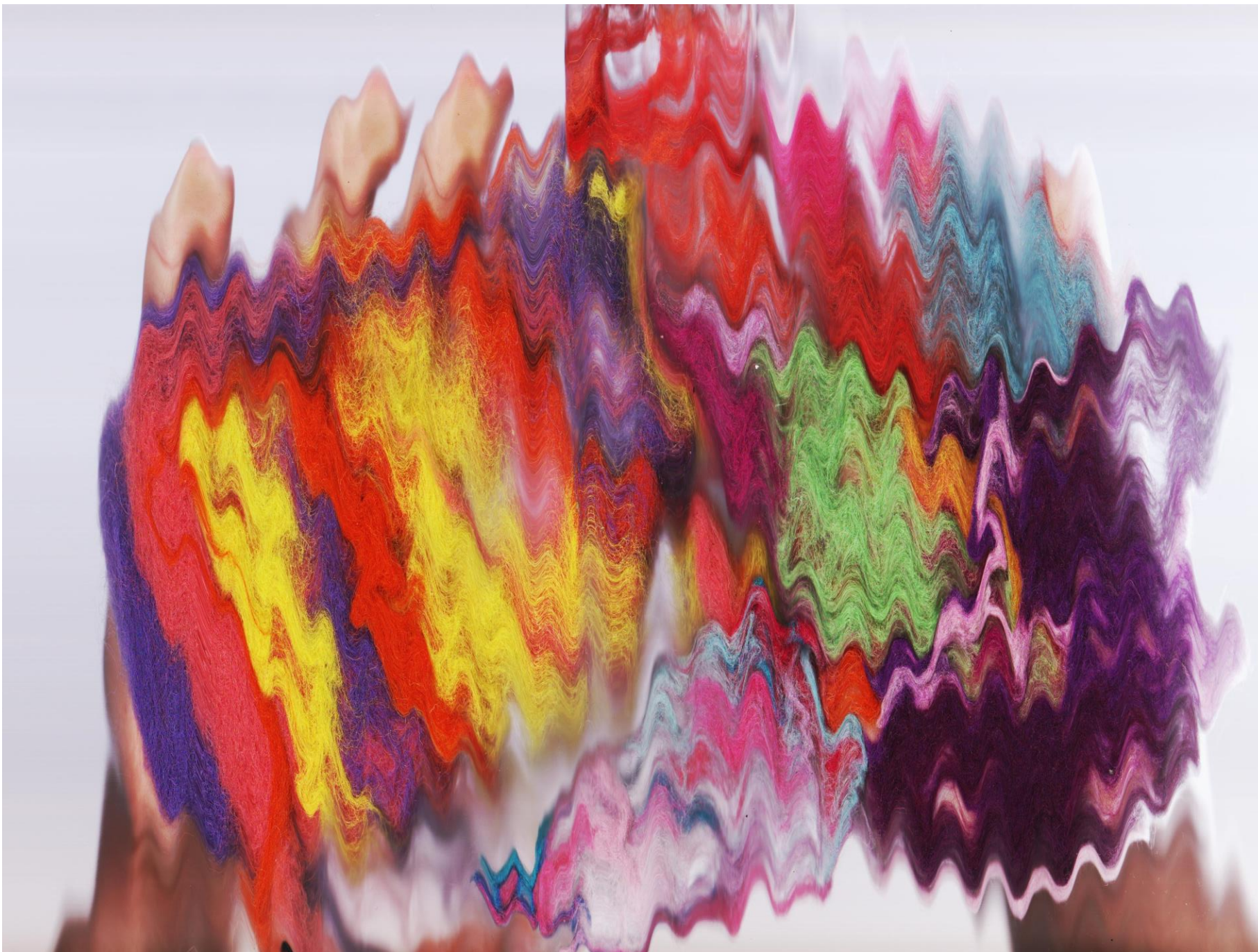
Felt Orgy – A Series