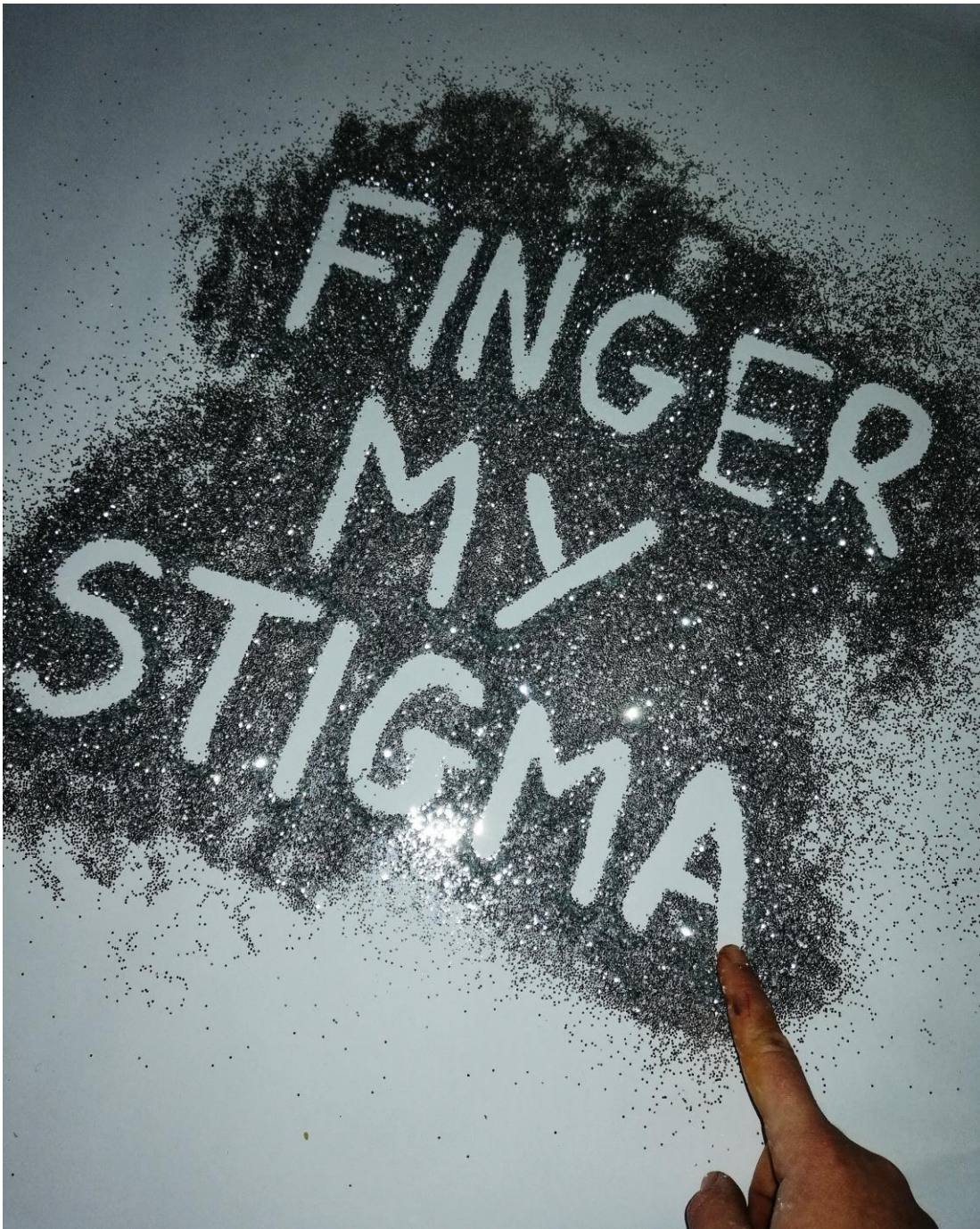
Finger my Stigma Photograph, glitter on paper A3 2020