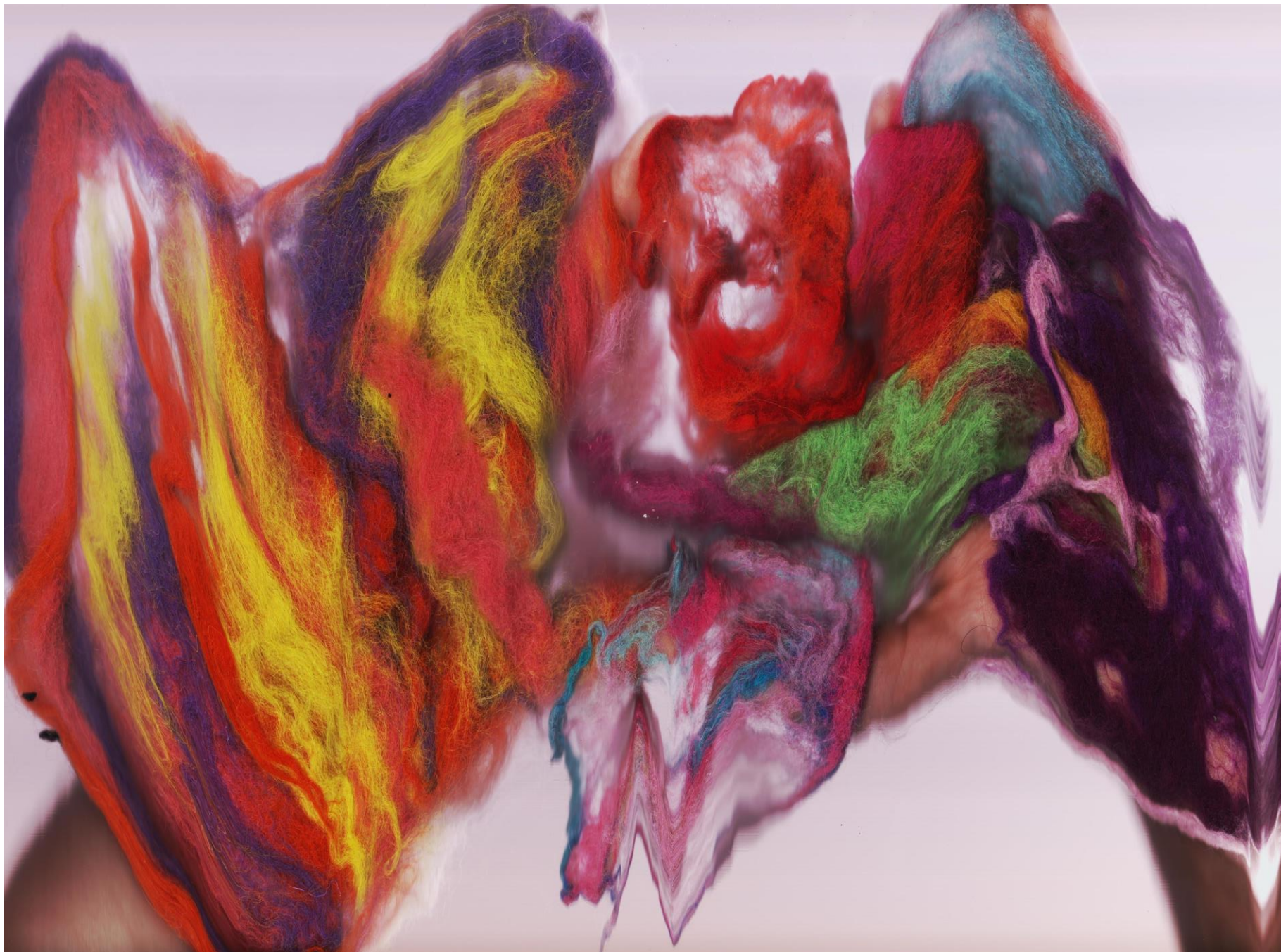
Felt Orgy – A series