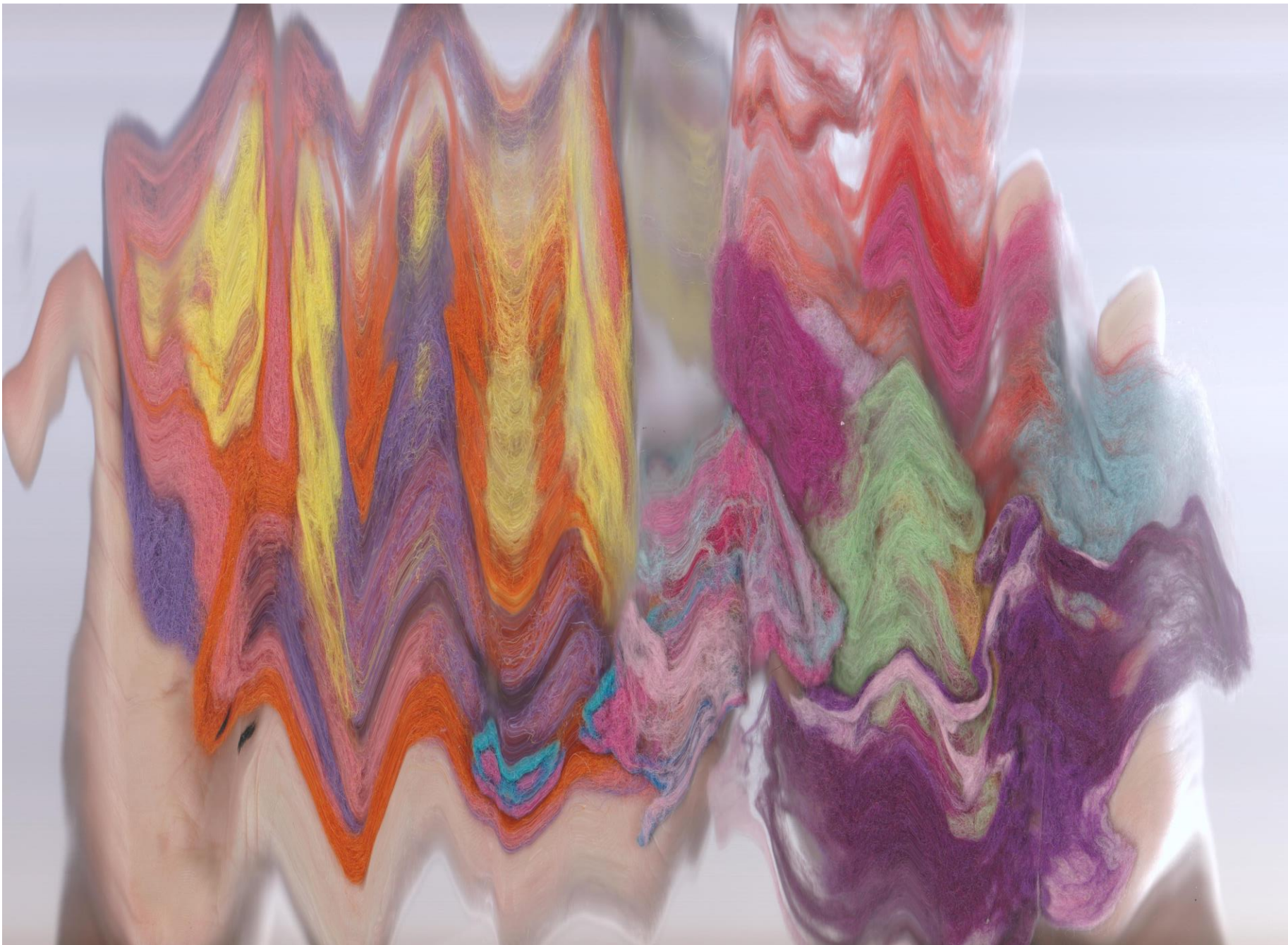
Felt Orgy – A series