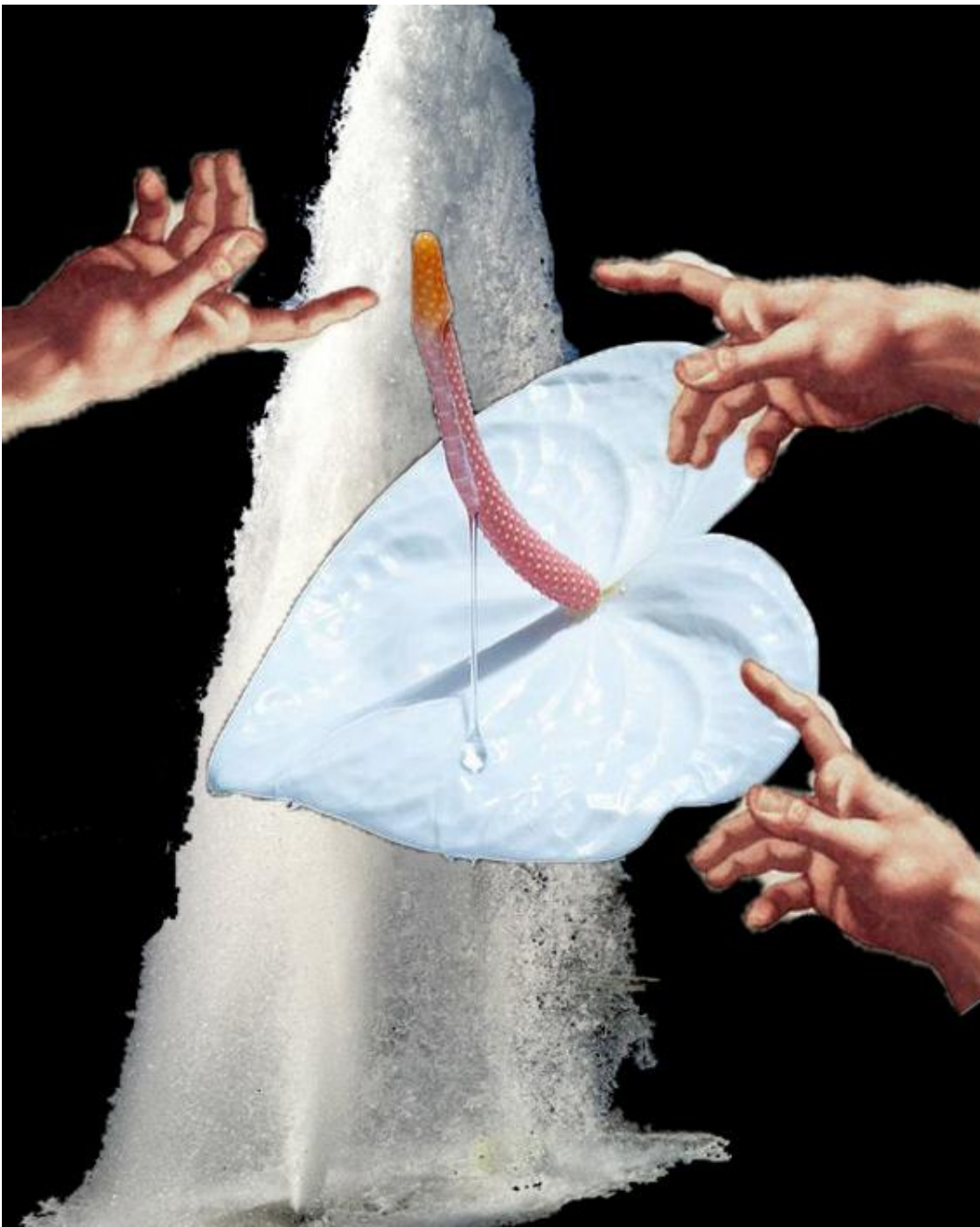
Left: Squirt Digital Collage 2020