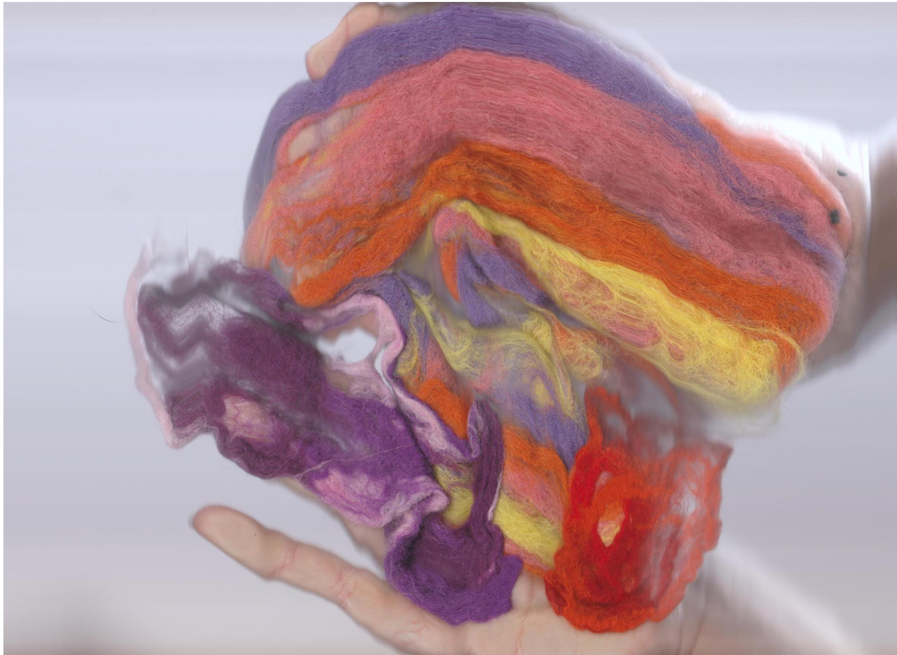
Felt Orgy – A series