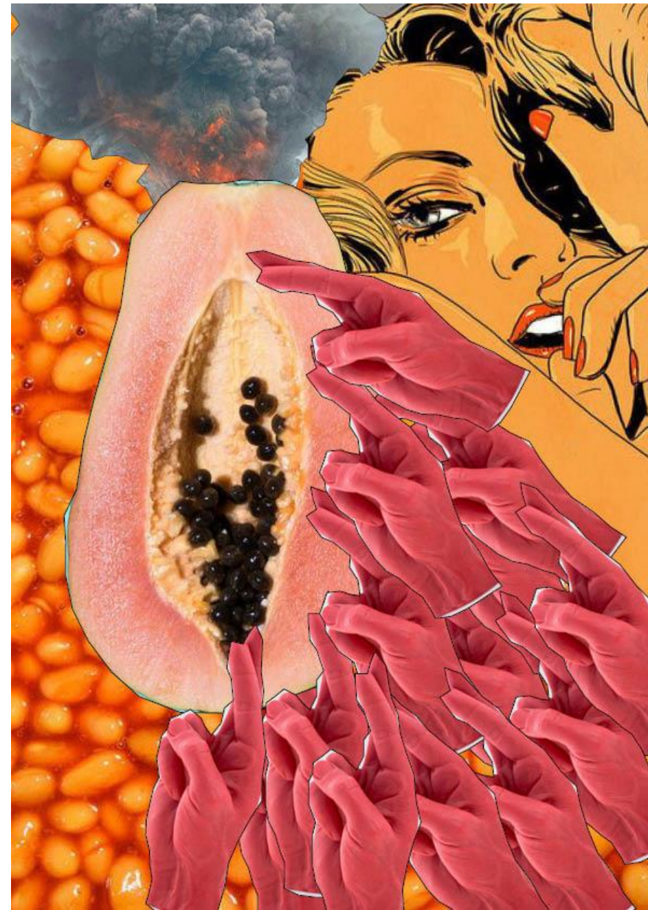
Right: Flick the Bean Digital Collage 2020