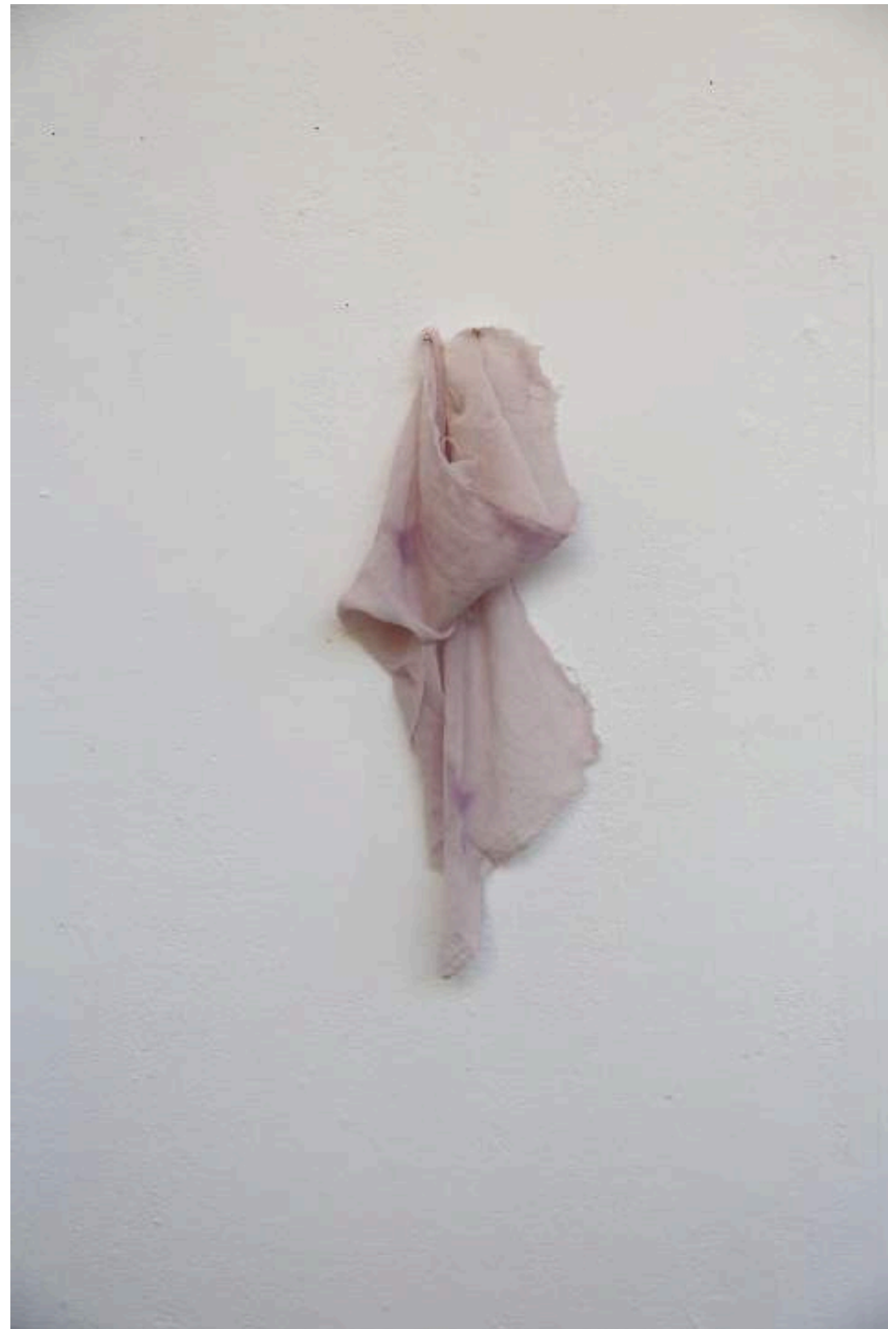
30cm by 10cm