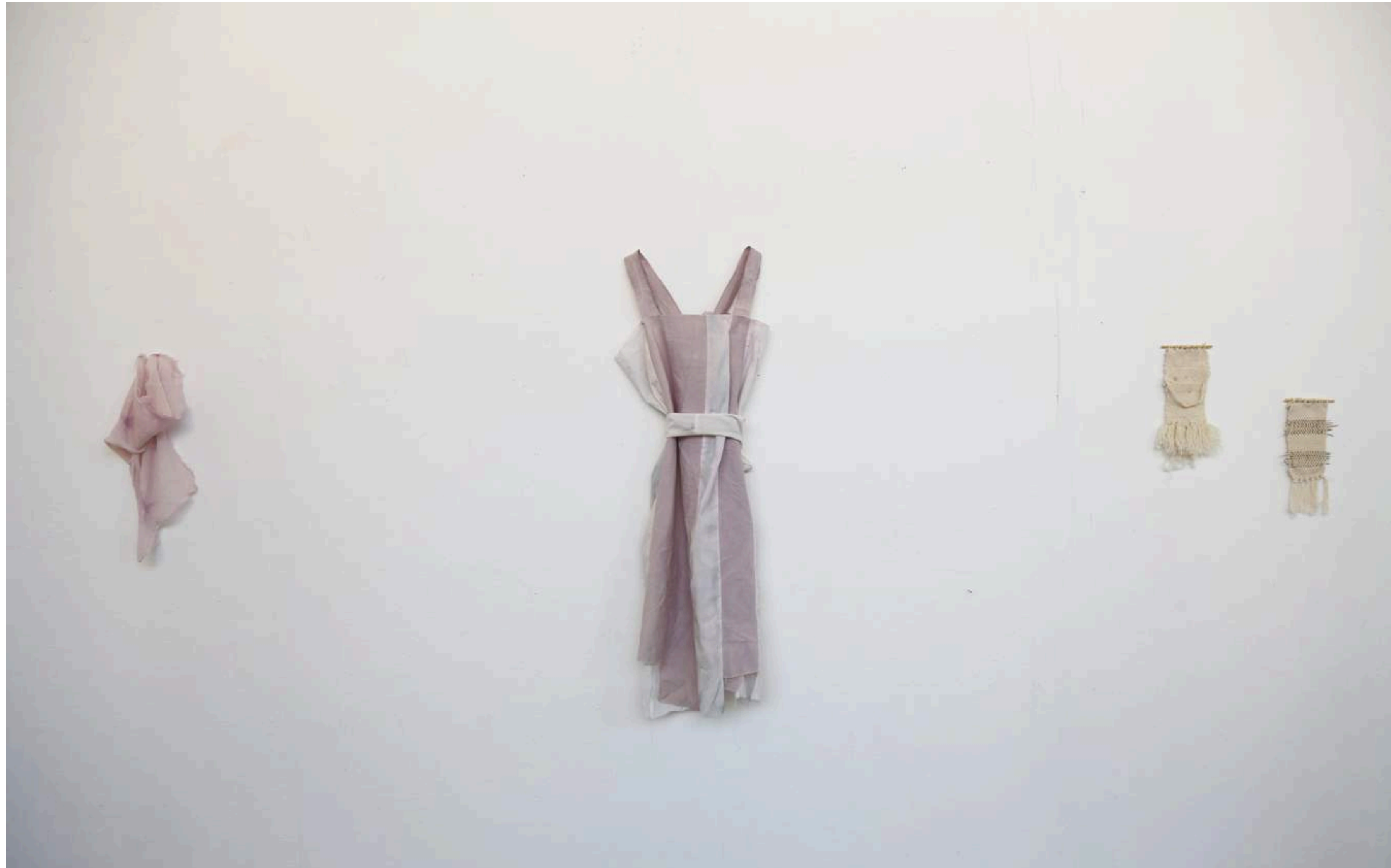
A collection of ritual handmade ritual artefacts displayed together in a instillation